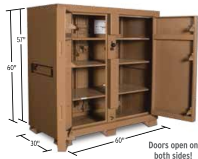
DOUBLE-SIDED SHELF CABINET MODEL 99