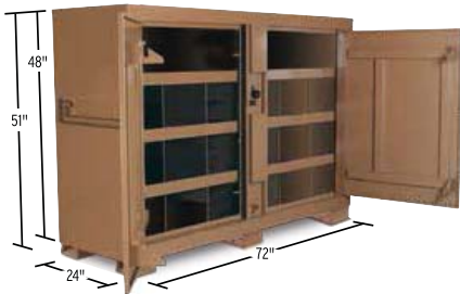
BIN STORAGE CABINET MODEL 129