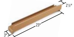
DOOR SHELF MODEL 493