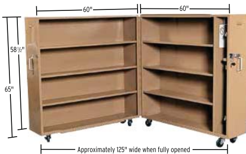
ROLLING CABINET MODEL 100